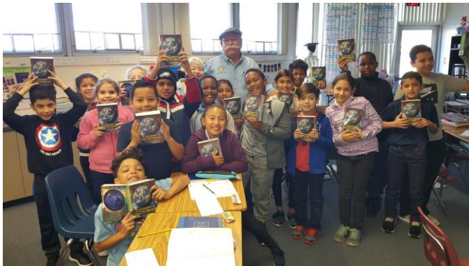
Boggy Creek Elementary School