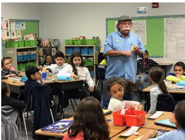
Ventura Elementary School